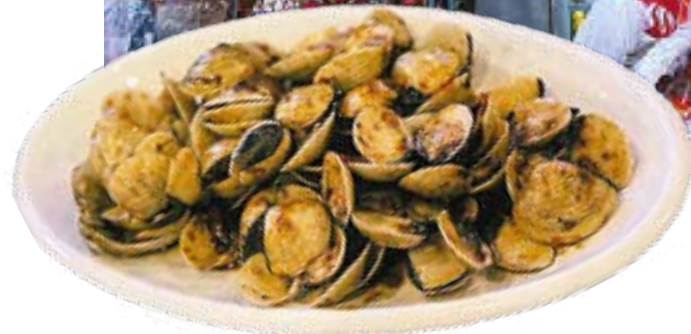
Above: Aquila during opening celebration Left: Classic dish Stir Fried Clams