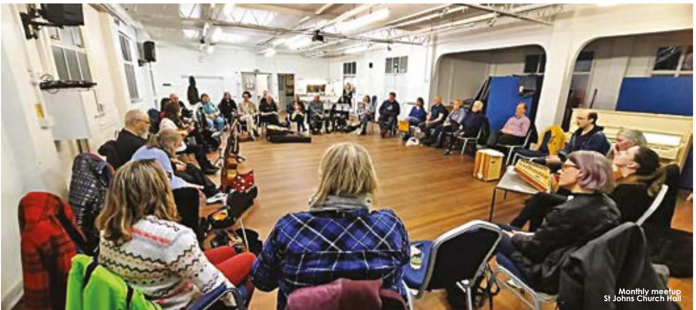
Monthly meetup St Johns Church Hall