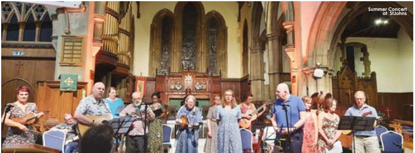
Summer Concert at StJohns