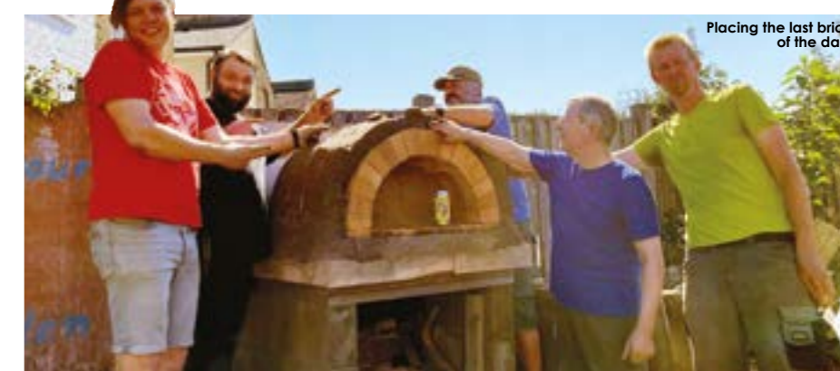
Placing the last brick of the day.

You need to be 12 or under and be in a household that is a member of BARA. Send your articles to us at BARACONNECT@gmail.com by the beginning of November.