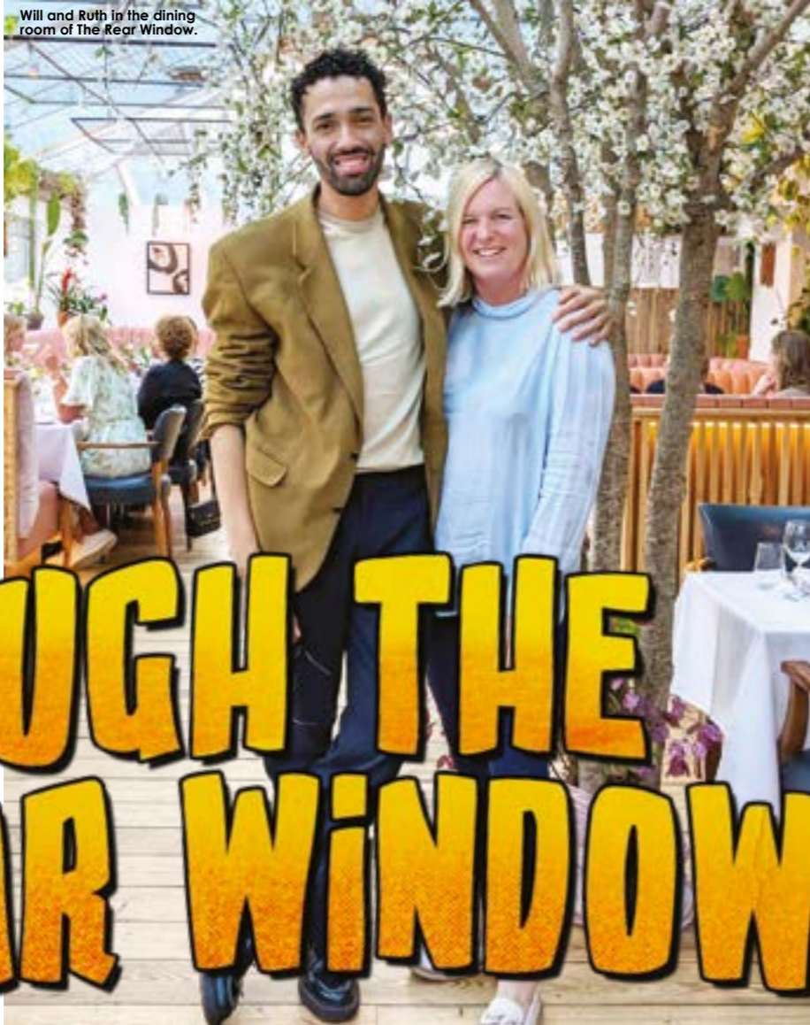
Will and Ruth in the dining room of The Rear Window.

Most people know that Alfred Hitchcock was born in Leytonstone but how many are aware of The Rear Window restaurant that has transformed the ground floor of the Hitchcock Hotel on Whipps Cross Road? Joyce Quarrie met with the owners of this high-end restaurant and discovered impeccable credentials that make it a go-to place for people from far and wide.