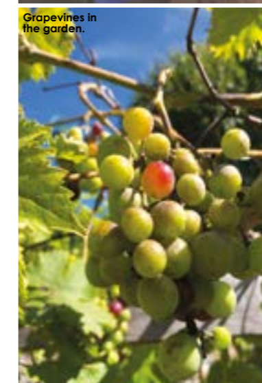
Grapevines in the garden.