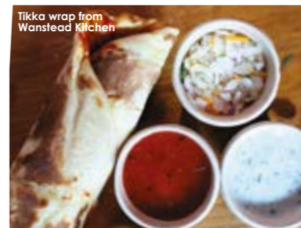
Tikka wrap from Wanstead Kitchen

Arch Deli - A really unique and quirky little place, you can sit outside, sip a glass of wine and share a plate of meat and cheese at £15 for 2 people