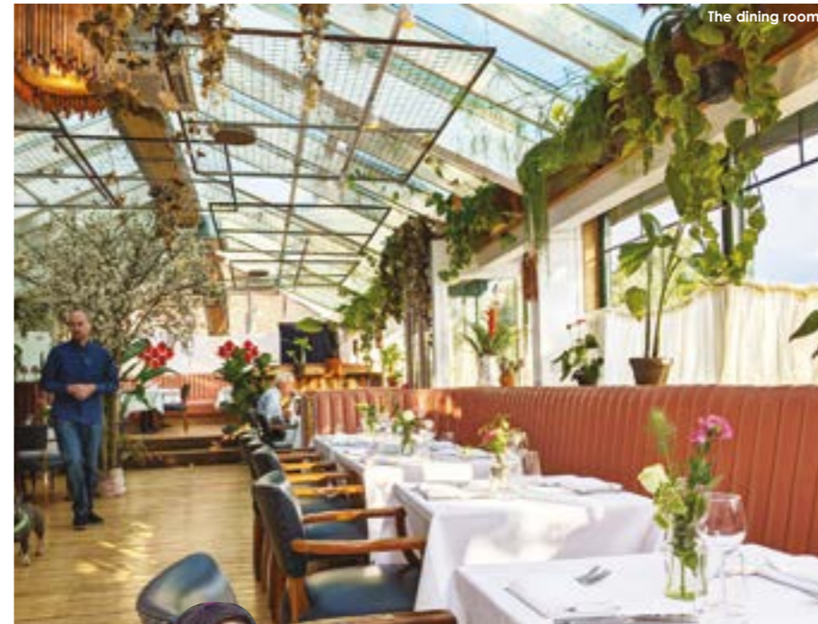
The dining room

The project started off in the hotel garden, then an unattractive car park. One review likened the transformation to the gardens of Versailles, Ruth and Will knew they were on the