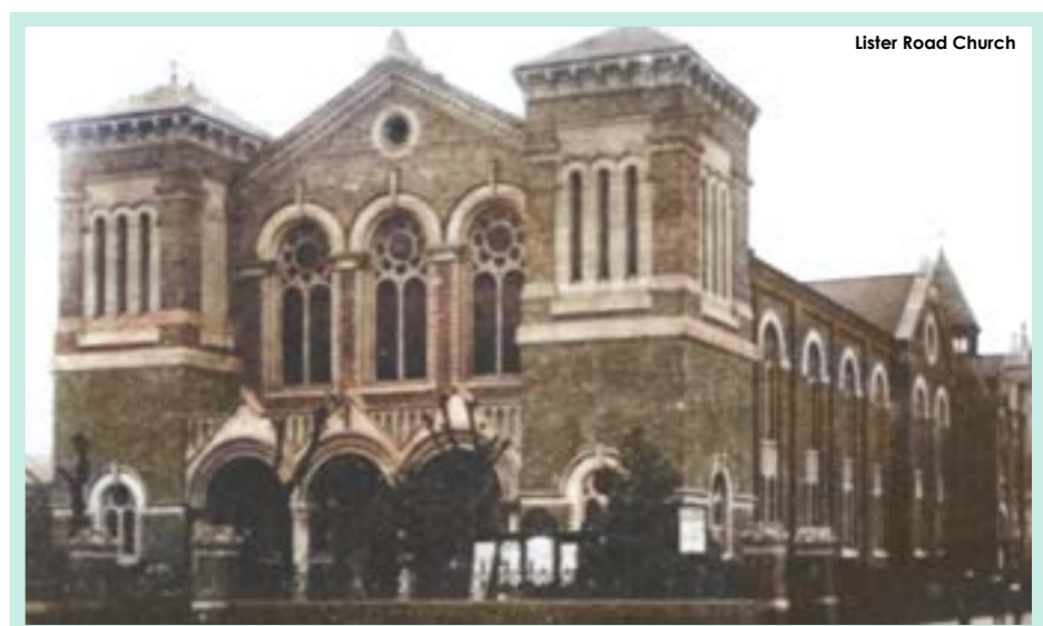
Lister Road Church