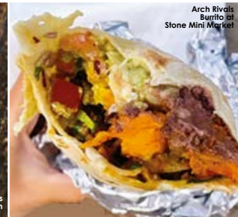
Arch Rivals Burrito at Stone Mini Market