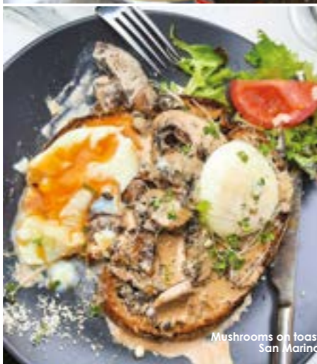
Mushrooms on toast San Marino