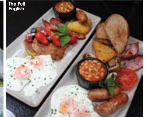
The Full English