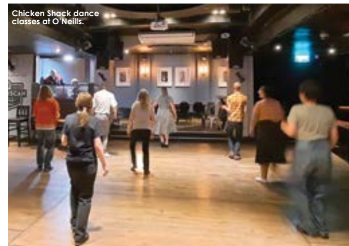
Chicken Shack dance classes at O'Neills.