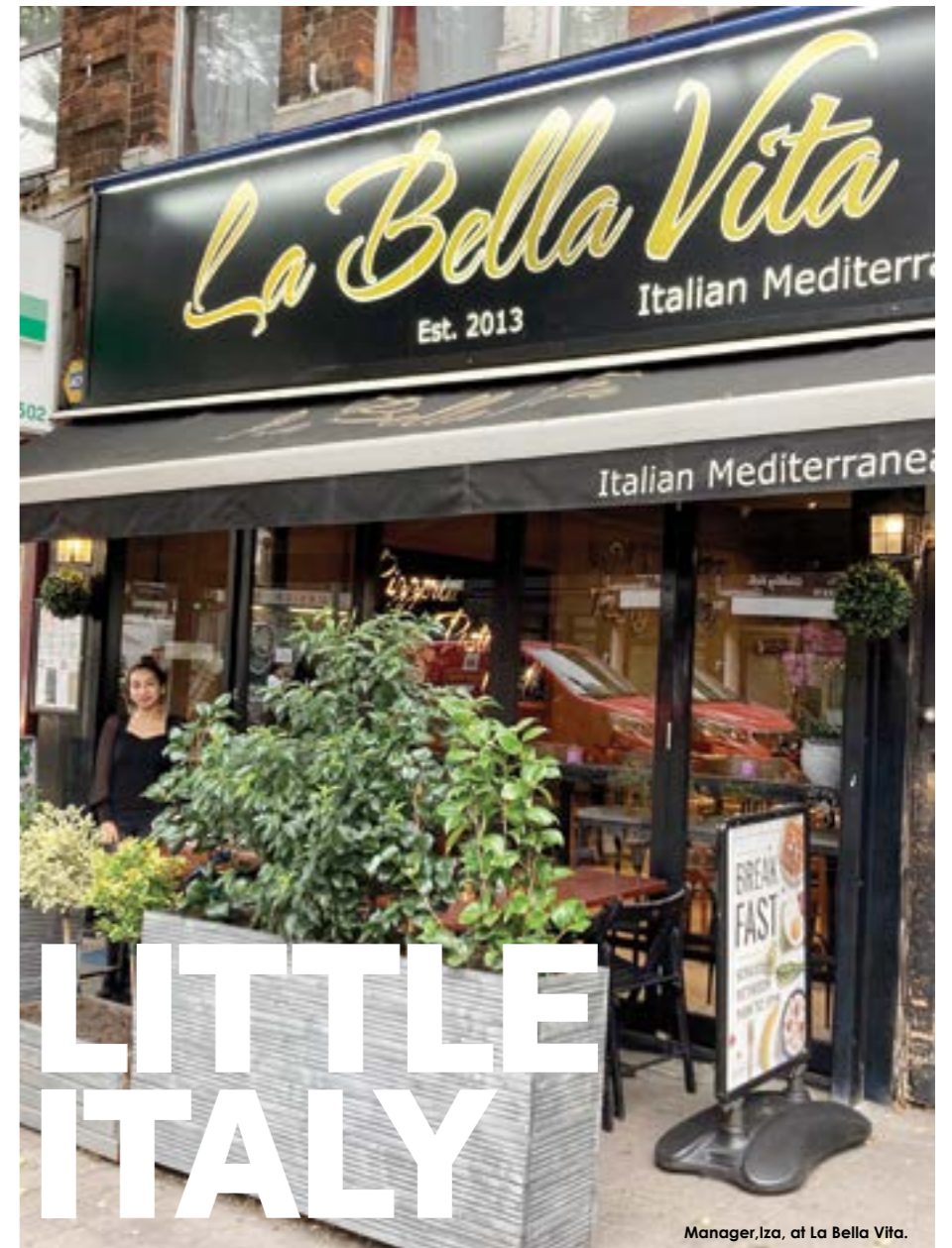
La Bella Vita Italian Mediterranean Est. 2013

La Bella Vita, 853 High Road Leytonstone, E11 1HH. Tel. 0203 441 3465. info@labellavitaleytonstone.com www.labellavitaleytonstone.com