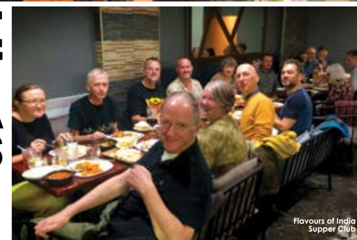
Flavours of India Supper Club

BARA events are popular, bringing people together while supporting local business. This autumn saw walks, quizzes, supper clubs and guided tours. If you came along to any of our events we hope you had a good time. Please come again. We have big plans for 2024 with pub crawls, cocktail nights, supper clubs and much more.