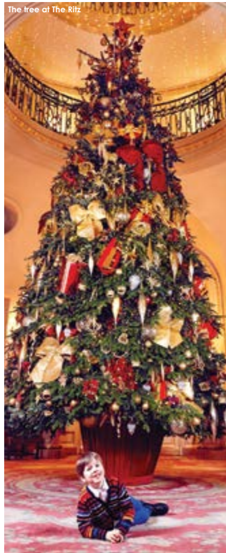
The tree at The Ritz

“ You have to think opulent, luxurious and over-the-top but also keep a sense of fun and balance