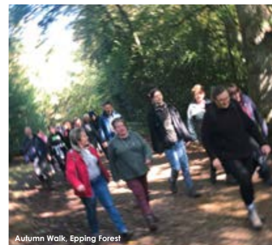
Autumn Walk, Epping Forest