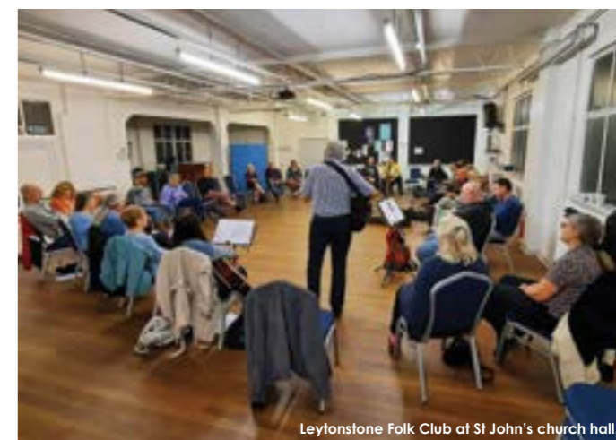
Leytonstone Folk Club at St John's church hall.

You could be out every night of the week doing an improving activity at little or no cost. So, no excuses, by this time next year we will be, fit, sharp and making our own clothes and dog jackets.