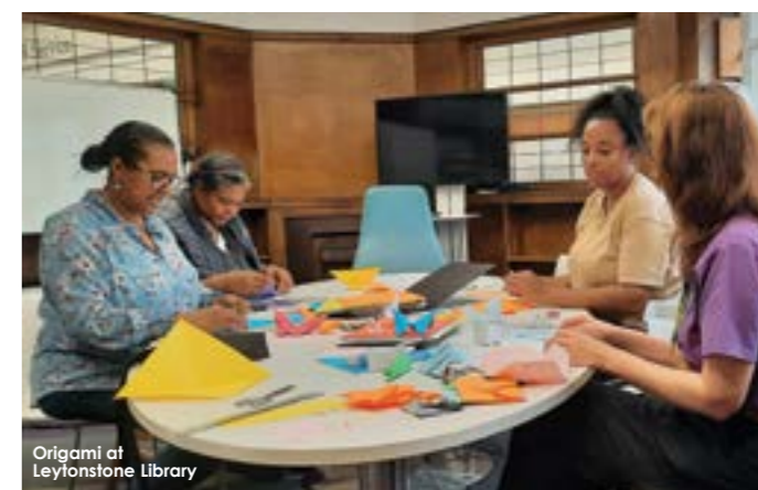
Origami at Leytonstone Library