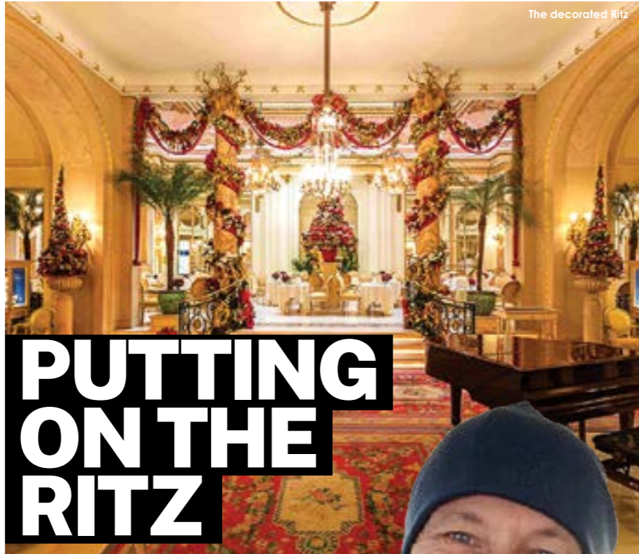
The decorated Ritz