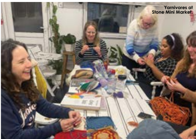
Yarnivores at Stone Mini Market.