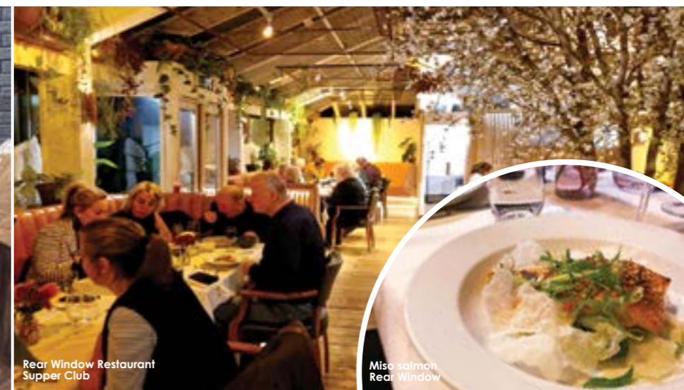
Rear Window Restaurant Supper Club