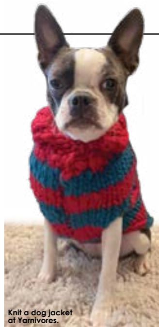
Knit a dog jacket at Yarnivores.