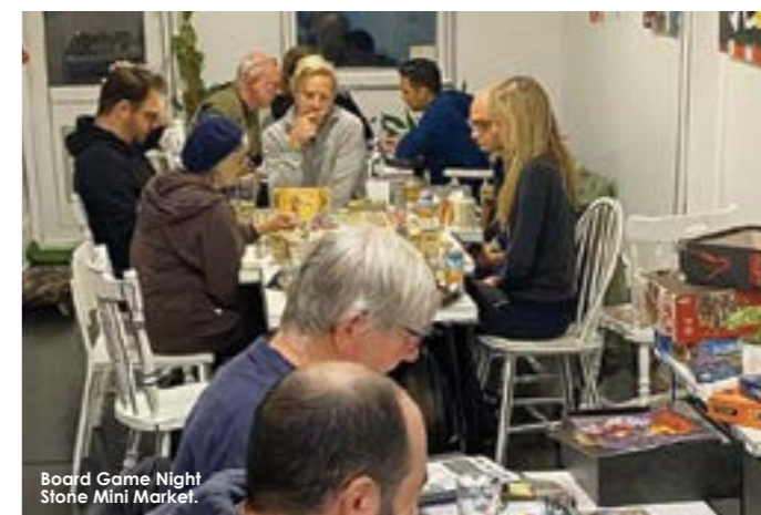
Board Game Night Stone Mini Market.