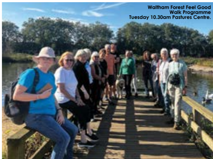
Waltham Forest Feel Good Walk Programme Tuesday 10.30am Pastures Centre.

You can learn to knit or crochet or just take along something on which you are already working.