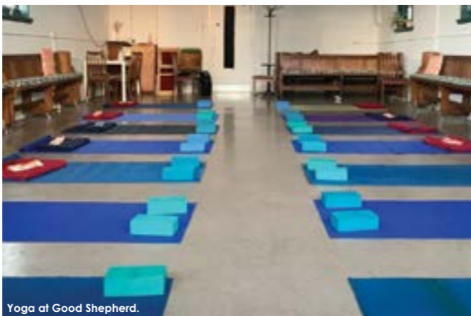
Yoga at Good Shepherd.